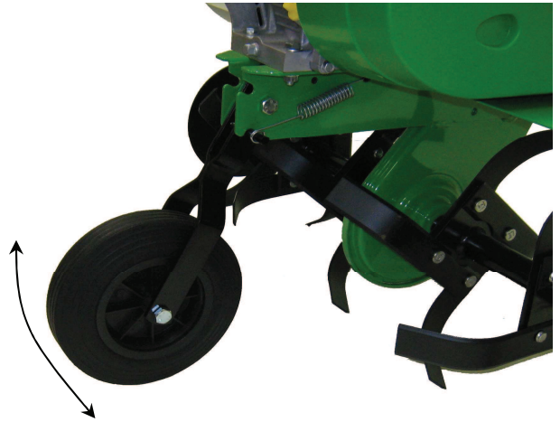
RETRACTABLE TRANSPORT WHEEL