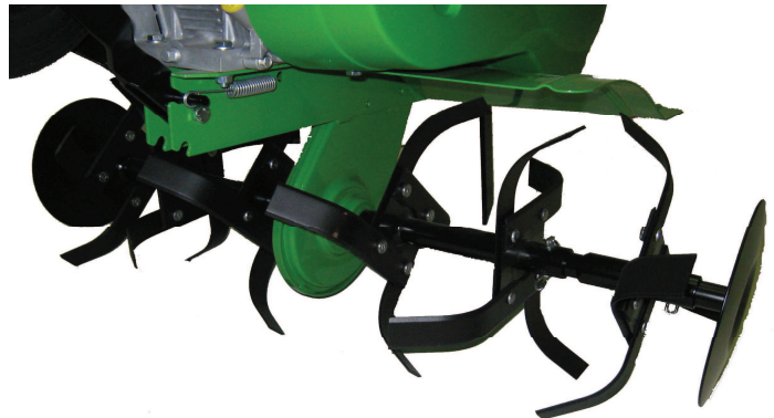
6 BLADES SETS WITH CROP PROTECTION DISC